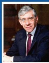
The Rt Hon. Jack Straw, MP