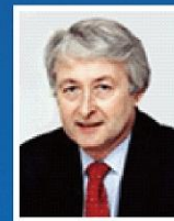
The Hon. Mr Justice Ramsey High Court Judge, TCC